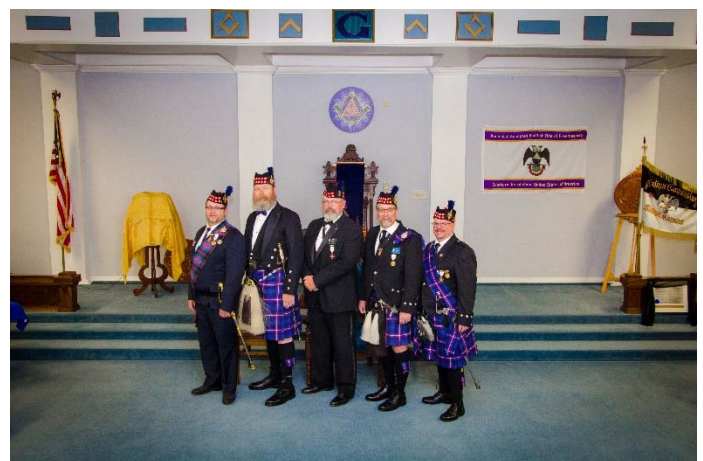
Knights of St. Andrew who performed the 29 o