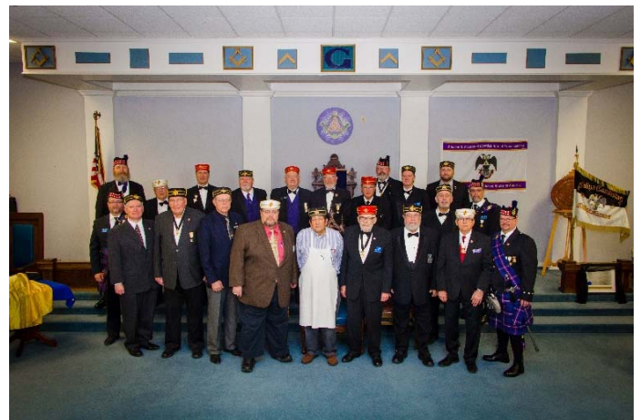
Everyone that helped put the Reunion on.